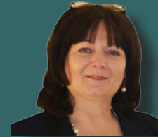
Vice Principal Deputy Designated Child Protection Teacher

The full policy document is available on request from the Principal