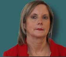
Pastoral Leader Designated Child Protection Teacher